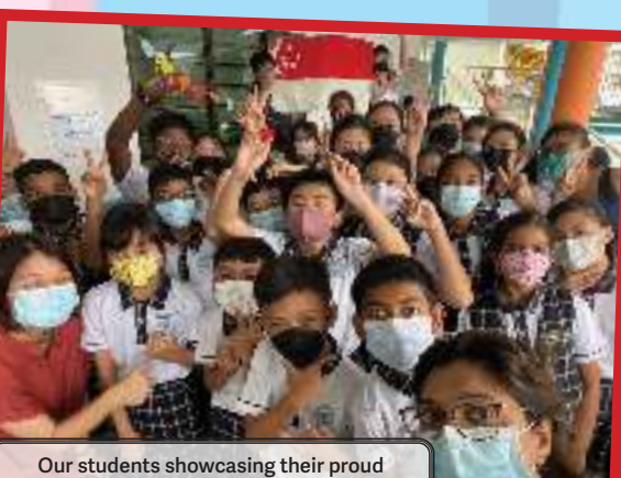
classroom display for National Day