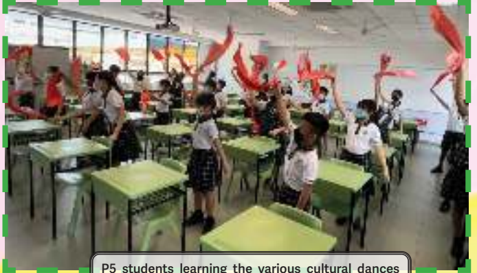
P5 students learning the various cultural dances found in Singapore